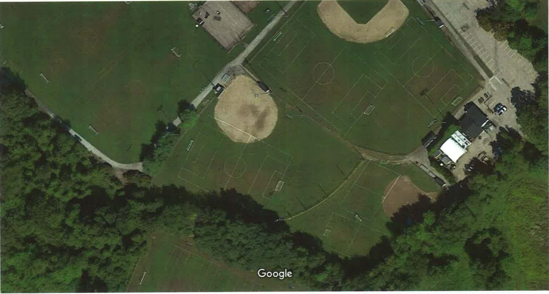
50 ft