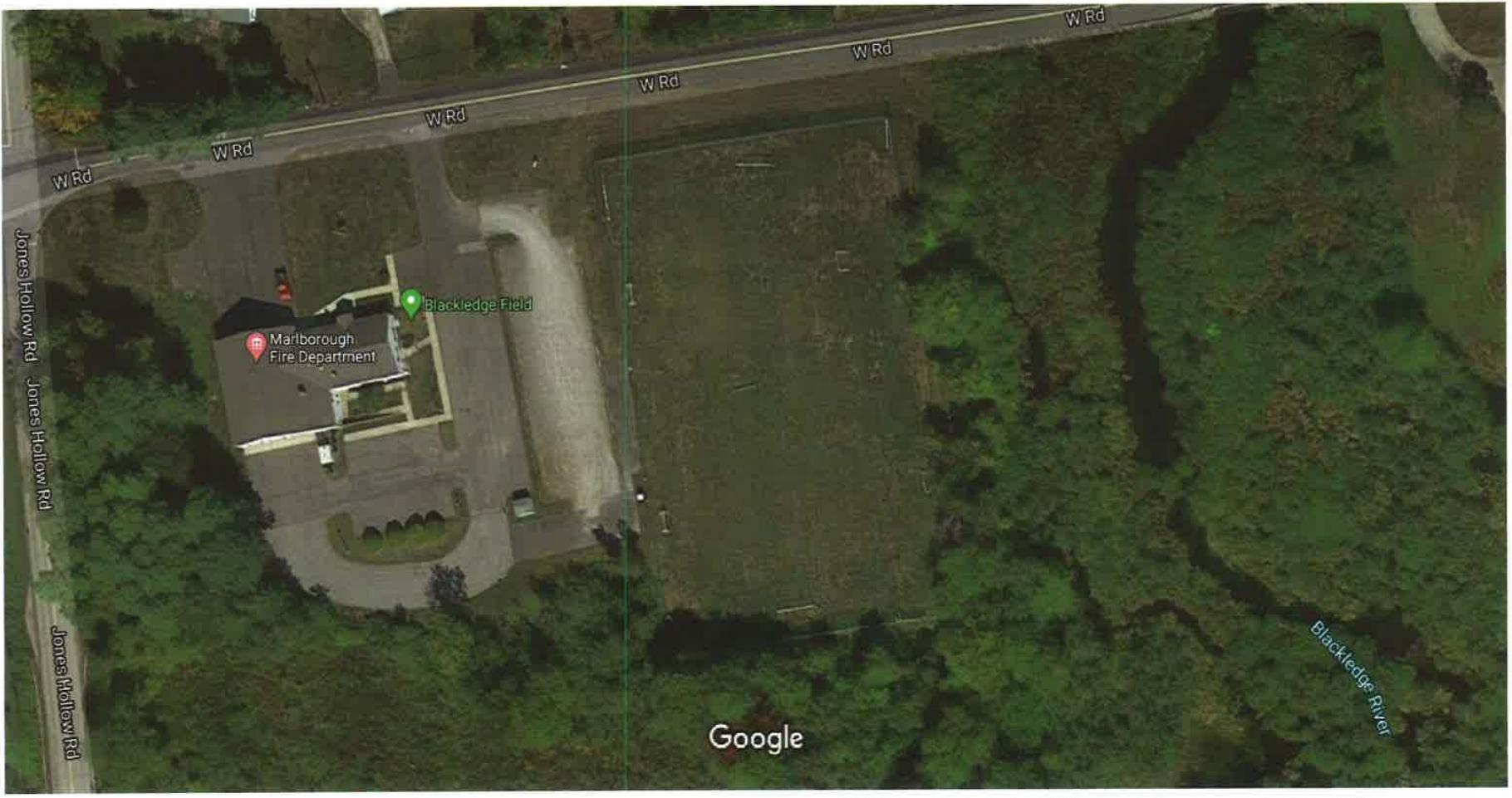
50 ft