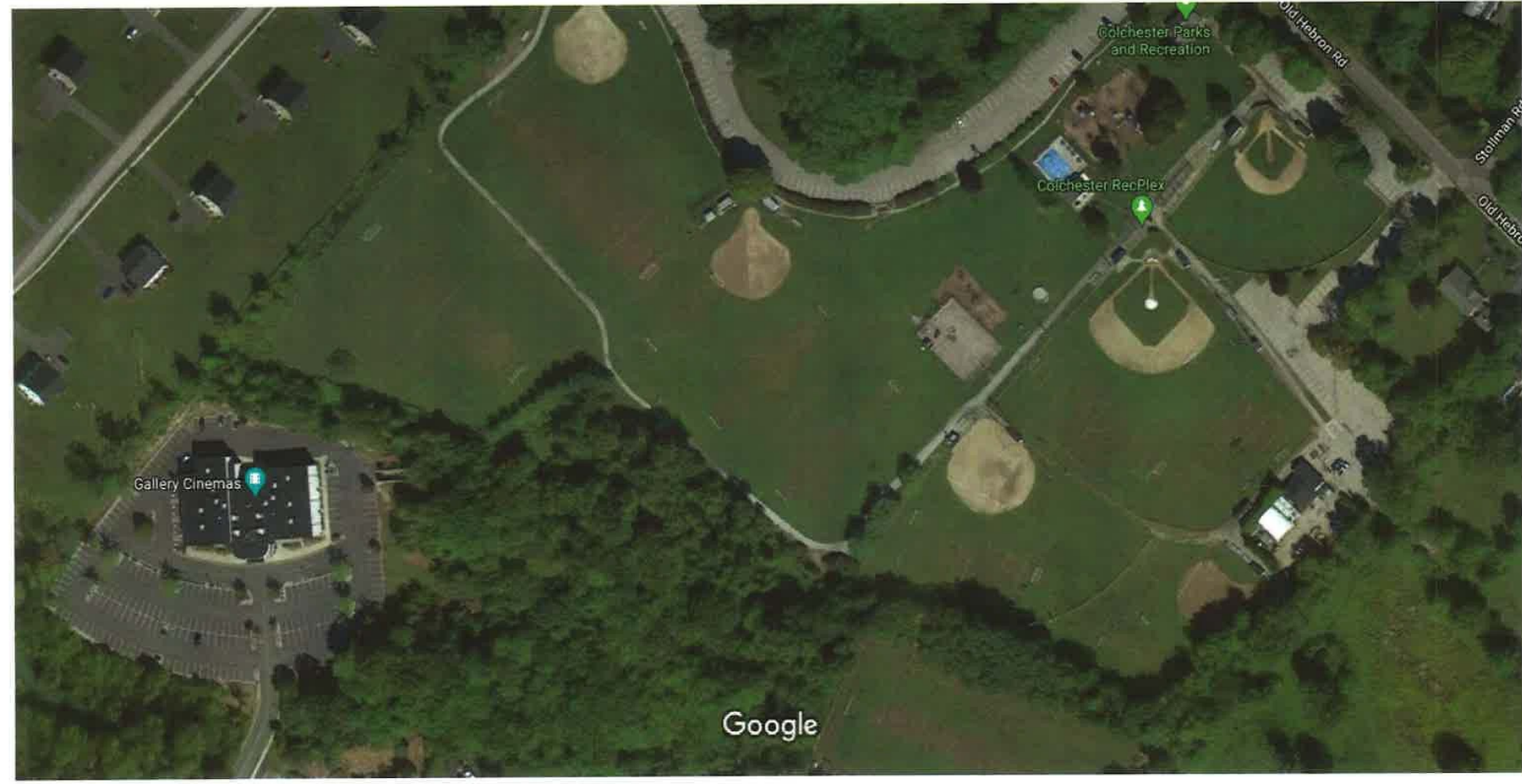
100 ft

Colchester Rec-Plex – all fields (except R1) – Used Multiple Sports. Fall R-8 reserved for Football. Football practices nightly upon its one Game Field. Mid July-Mid Nov. (96 days) – 2-3 hr practices, 3 games per home event.