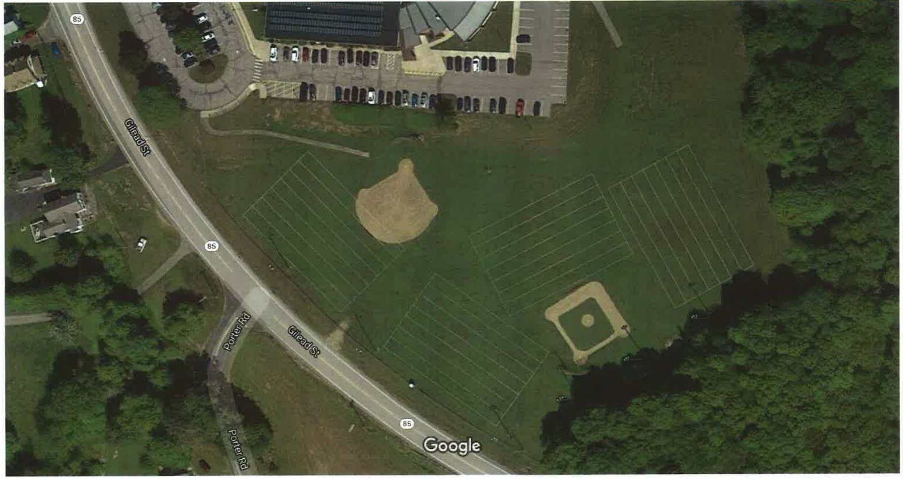
50 ft

Example #2 Hebron Off Site Midget Football Practice 1/3 size fields – Gilead School Note: Marginal Use due to EEE closures 2019. Normal practice time 6-8 pm