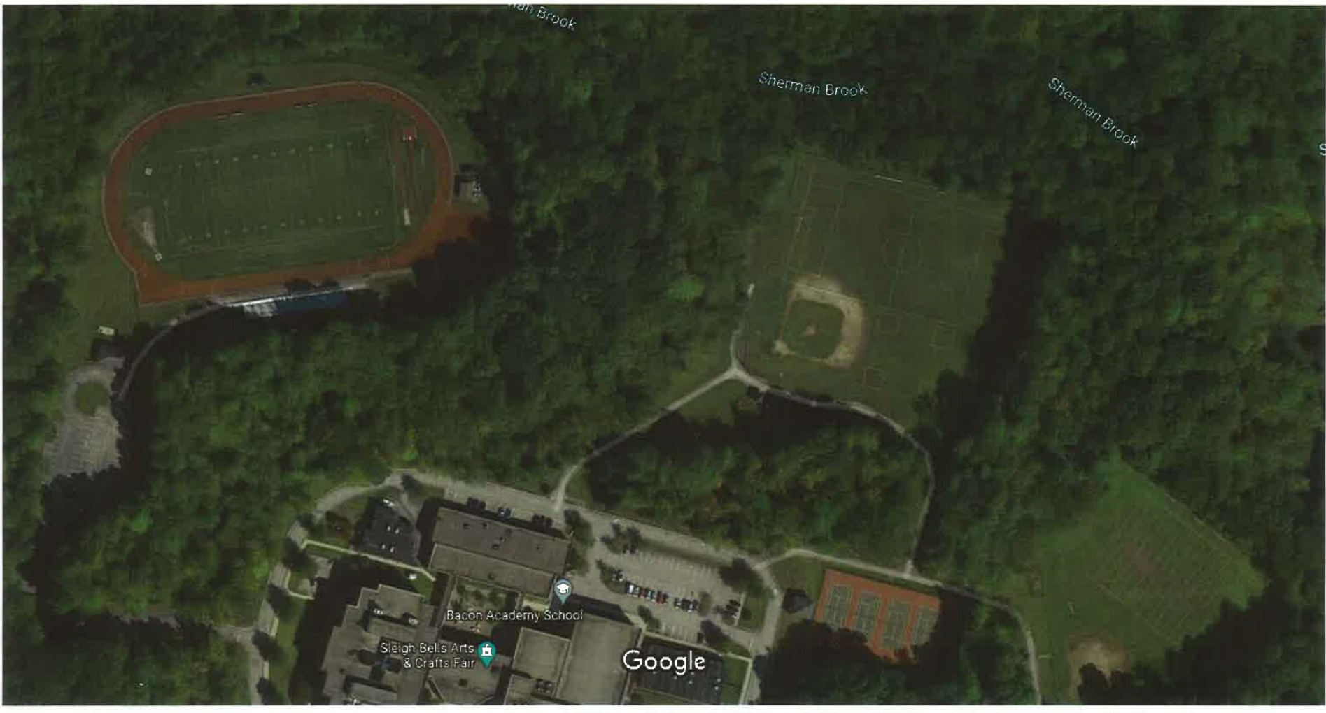
100 ft

Bacon Academy – Natural Turf 4 Sport Game Field – Water Canon/Well Irrigated. Baseball And Softball Field, Non –Irrigated Multi Use Practice Field. Clear Wear and Moisture Issues, Softball Excess High Water Table in Spring, No Drains, Baseball Outfield Insufficient Moisture And Wear Stress.