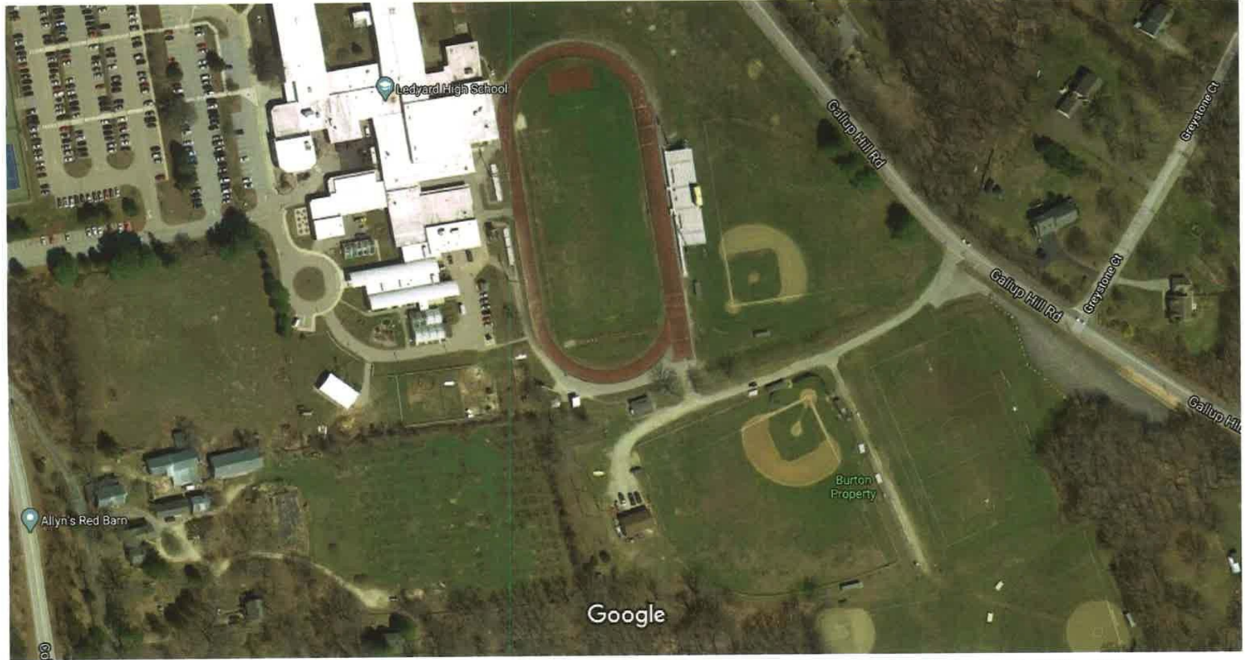
100 ft

Ledyard High School – Natural Grass Game Field, Non permanent Irrigated Fields, Clear Moisture Stress and Wear Stress in Practice Areas and Game Field. Soccer relocated games to alternate location.