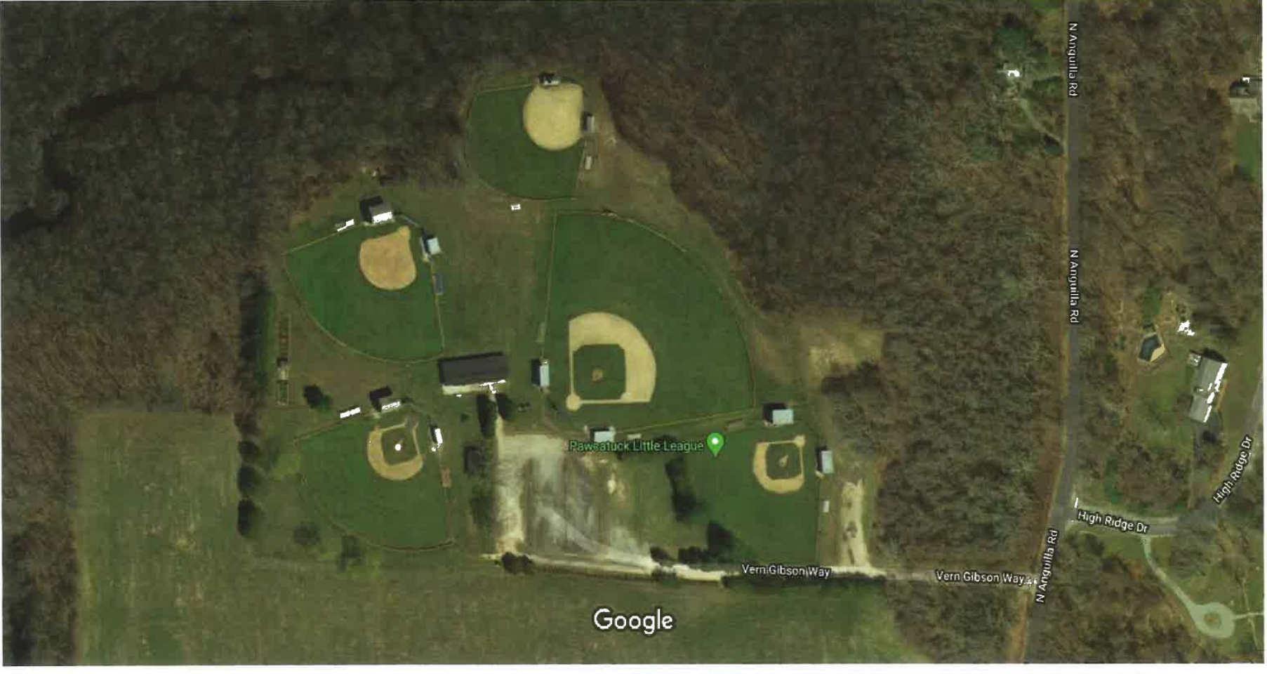
100 ft

Example of Irrigated Baseball Complex – Fields Clearly Green vs Off Field Moisture Stress