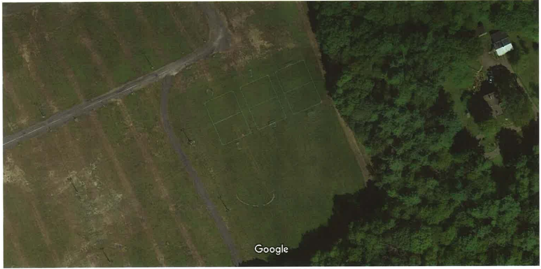
Imagery ©2020 Maxar Technologies, U.S. Geological Survey, Map data ©2020 50 ft

Example of Hebron Off Site Practice Fields. Jr Soccer located in under utilized portion Lion Park Parking area.