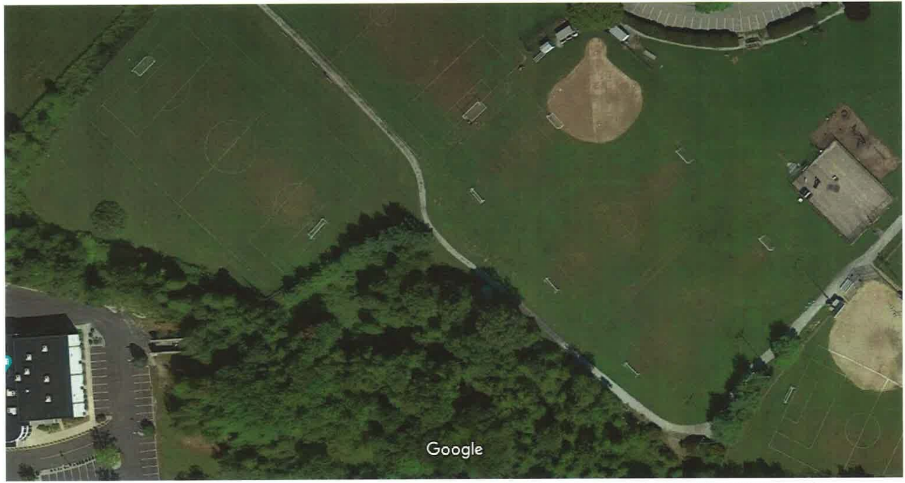
Imagery ©2020 Maxar Technologies, U.S. Geological Survey, Map data ©2020 50 ft