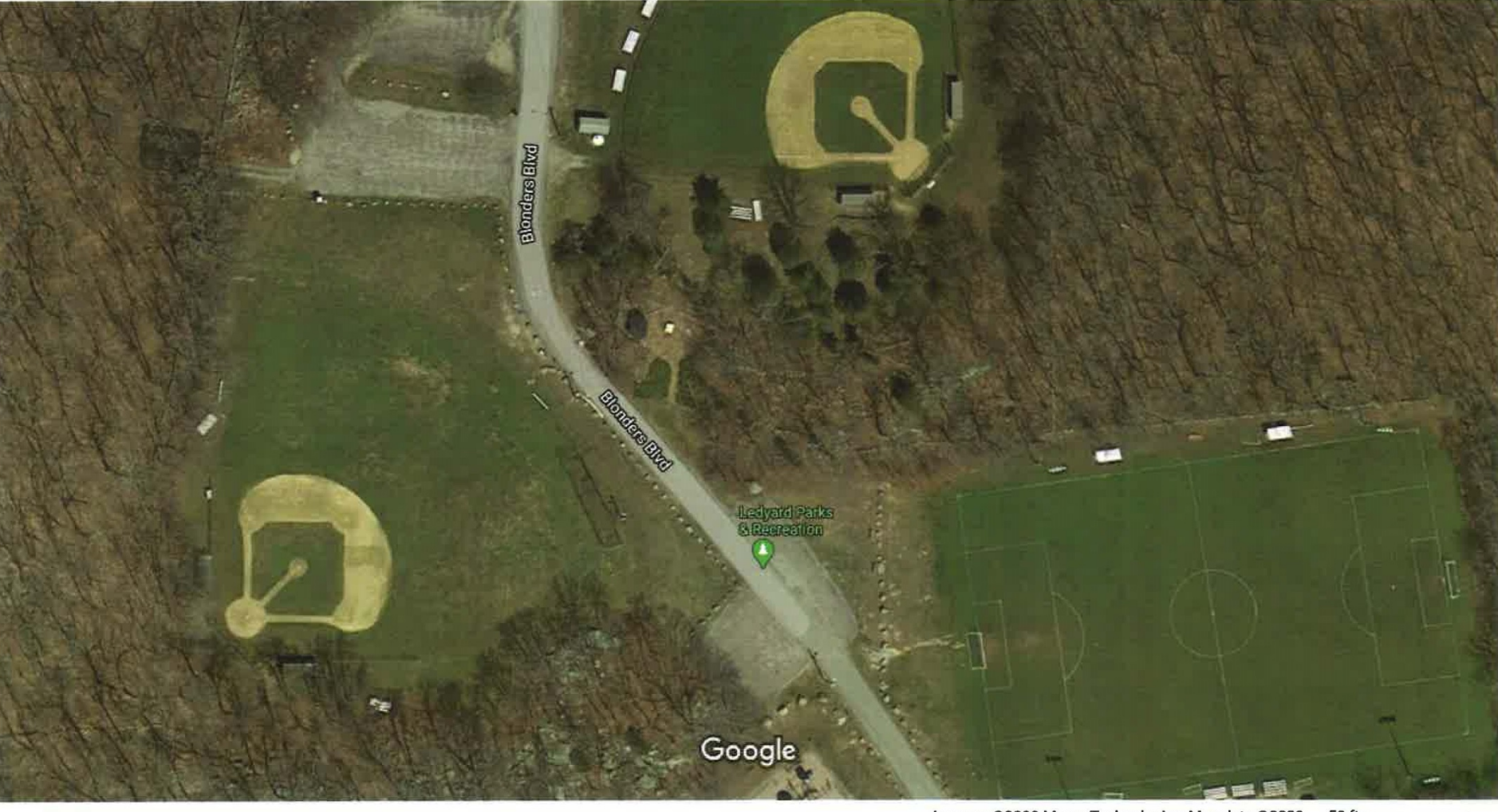
Imagery ©2020 Maxar Technologies, Map data ©2020 50 ft

Ledyard – Col. Ledyard Park- Soccer Field –Full Well Based Irrigation – High School Game Field, Northerly Baseball – Modified Rain Train/Tank Irrigation, West Baseball/Multiple Use –No Irrigation – Clear Moisture Stress and Wear.