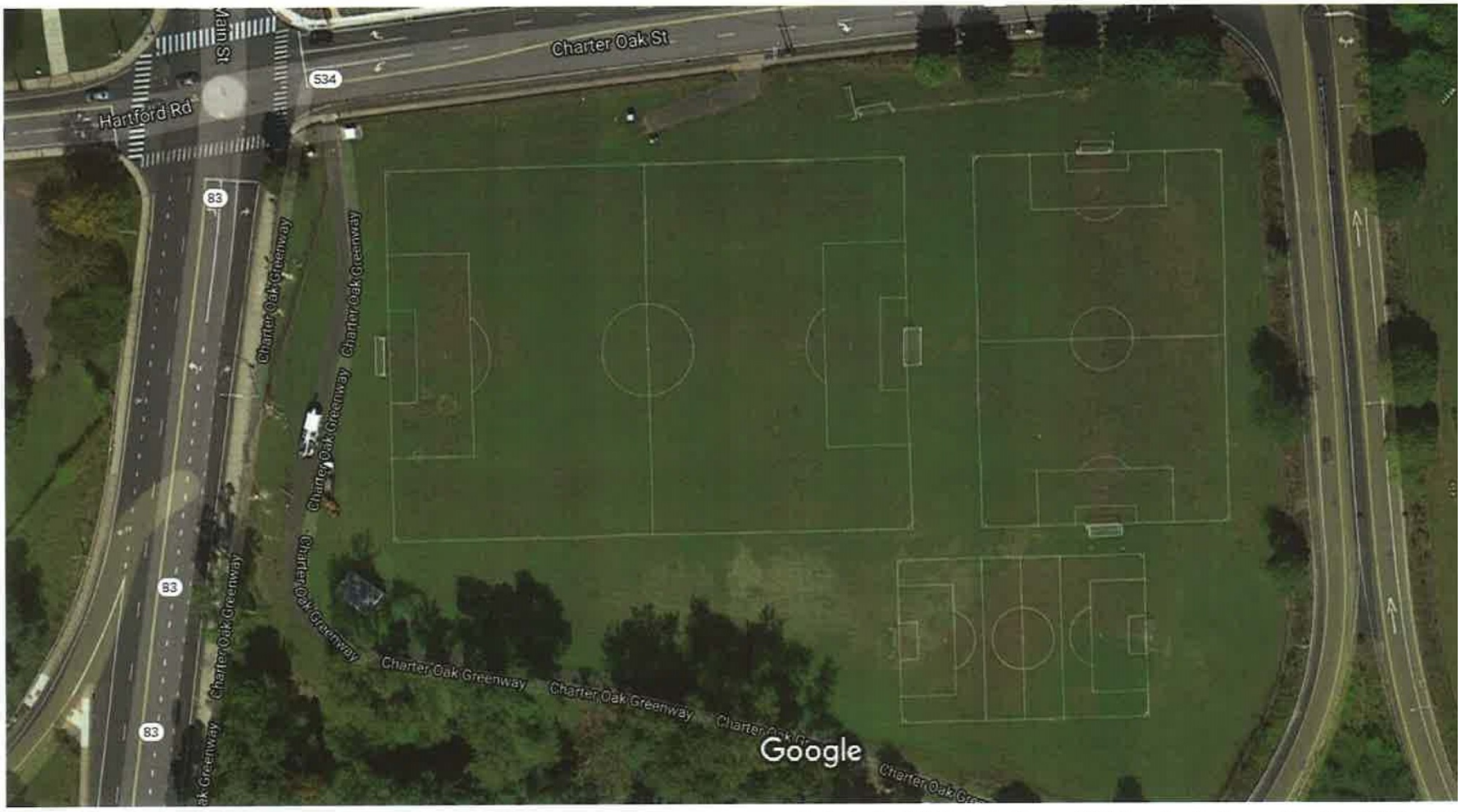
50 f

Charter Oak – Bennett Academy – Wear and Moisture Stress