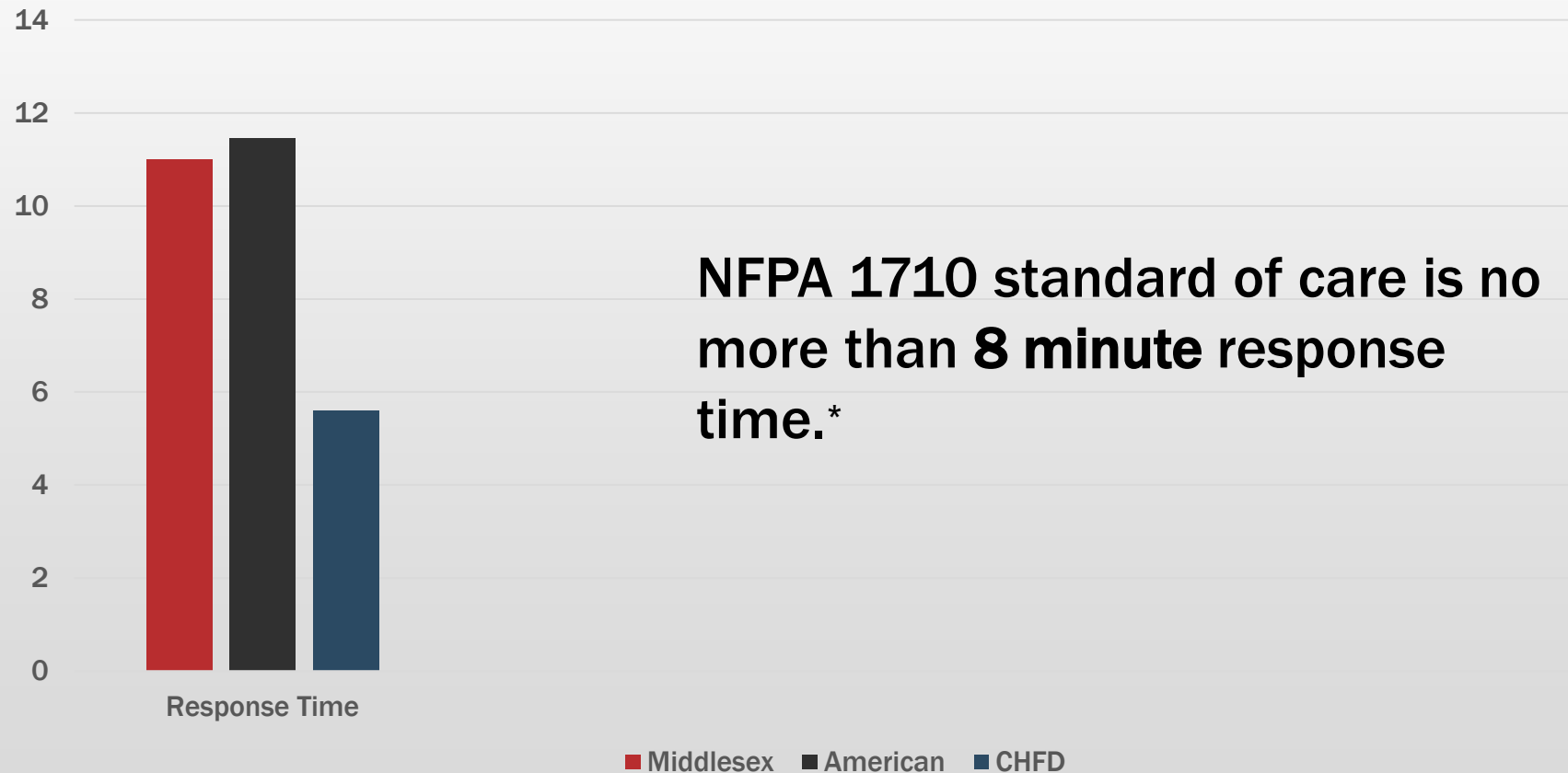
Response Time by Provider