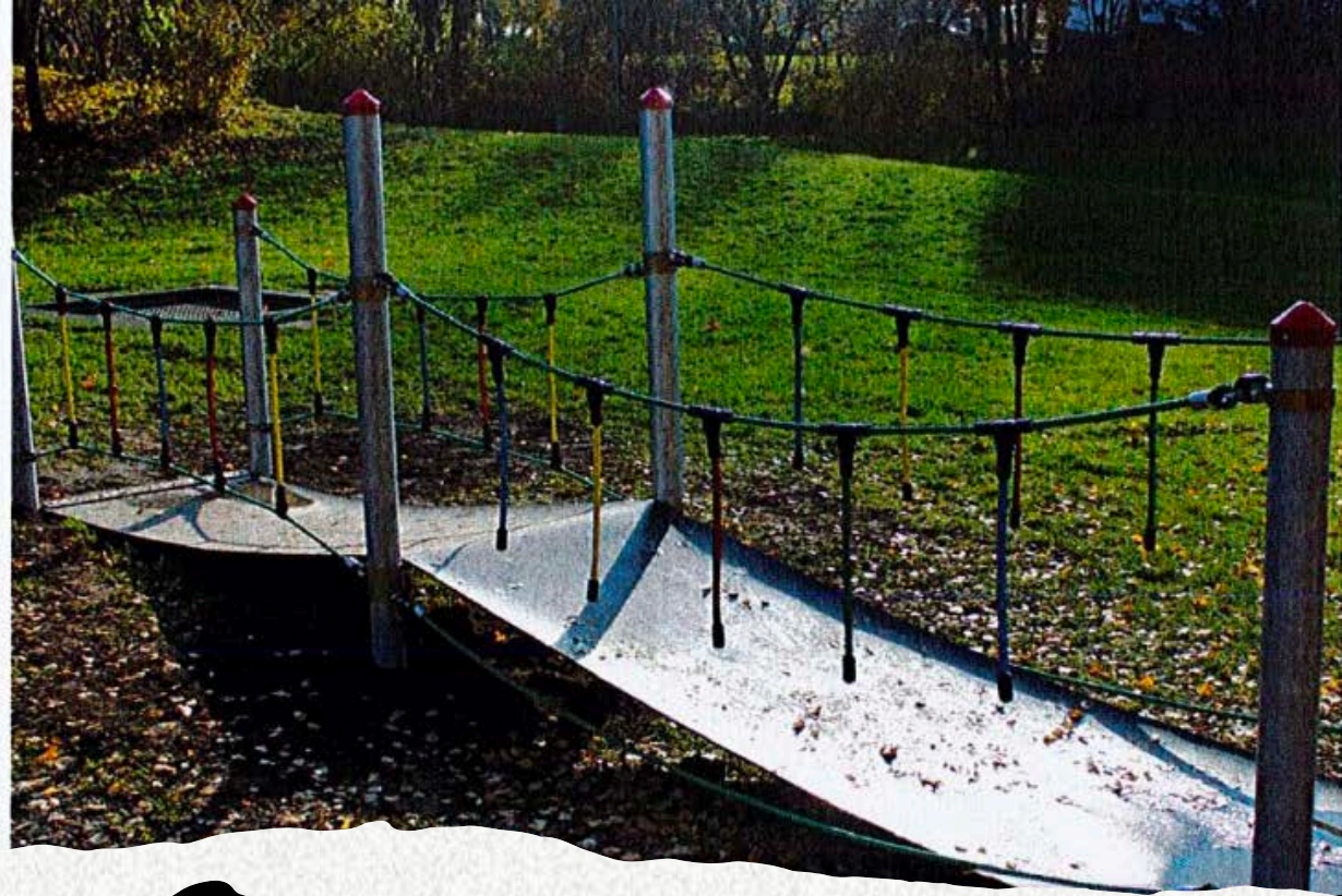
“Haiger Inclusion Ramp”