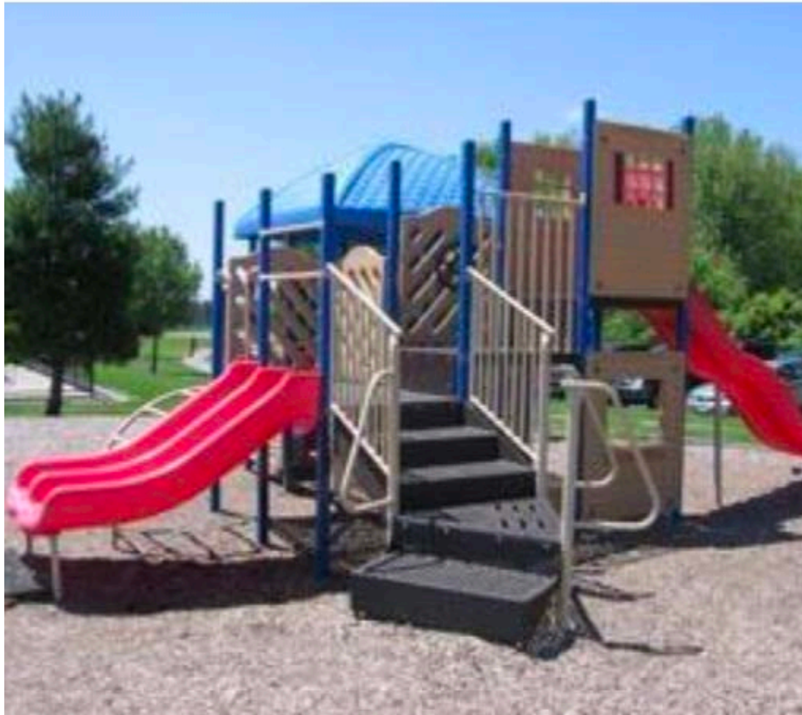
The Playground in 1996